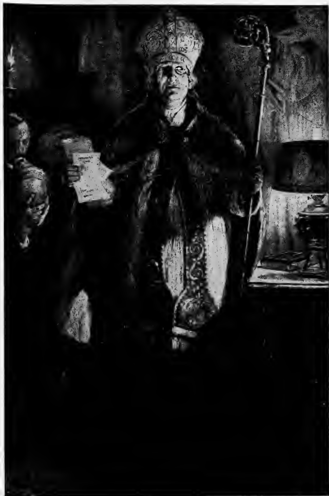
AN ARCHBISHOP IN HIS FULL EPISCOPAL ATTIRE